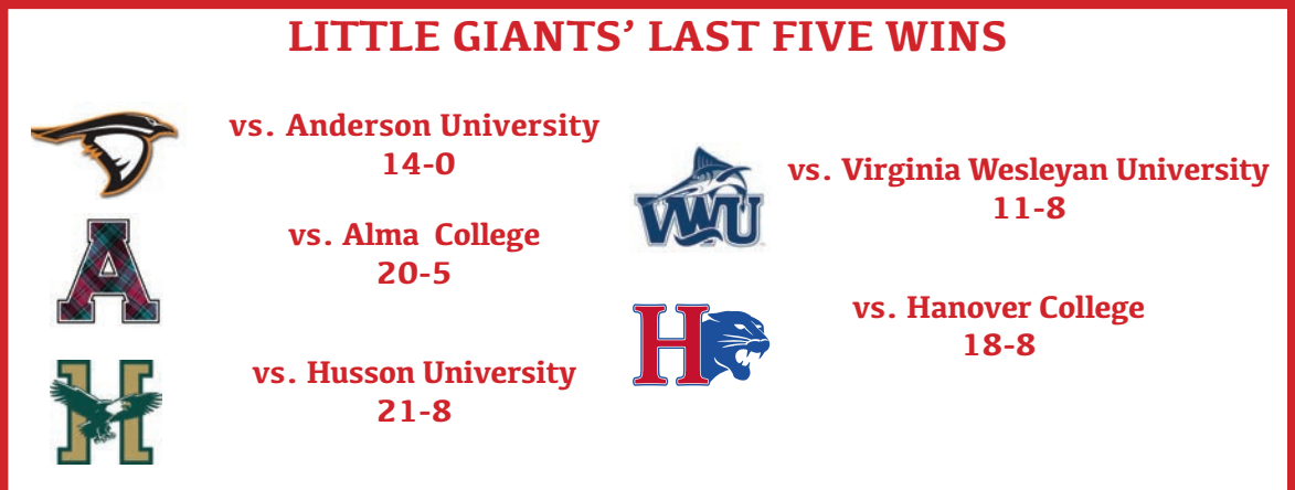
GRAPHIC BY ETHAN WALLACE '25